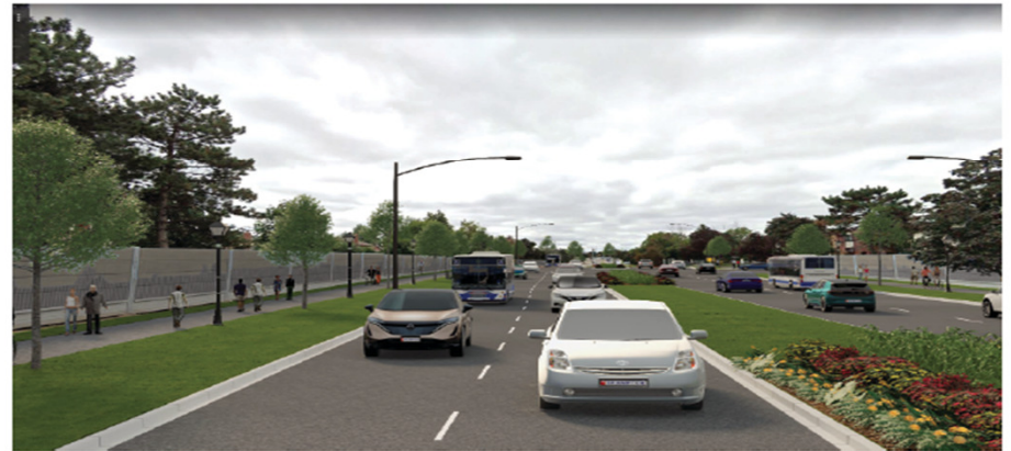
Option 3: medium-tone, warm grey background and darker-tone, neutral grey trees