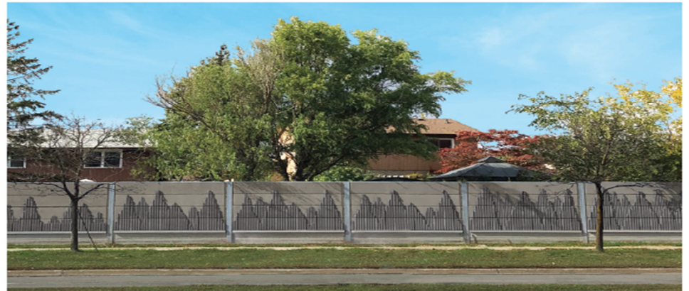
Option 3: medium-tone, warm grey background and darker-tone, neutral grey trees