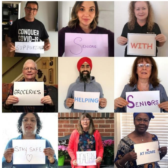
COVID 19 SENIORS SUPPORT TASK FORCE SOCIAL MEDIA POSTER