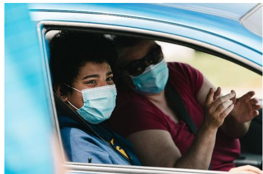
RESIDENTS ATTENDING A VOLUNTEER APPRECIATION DAY EVENT (JULY 2020)