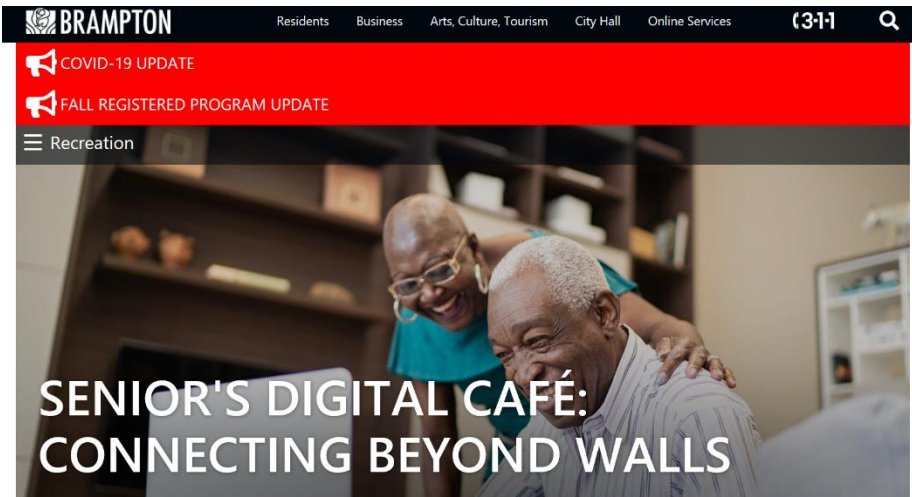
SENIORS DIGITAL CAFÉ PROGRAM WEB POSTER